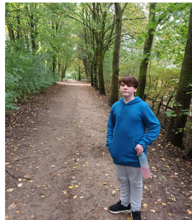
Taking part in a countryside walk.